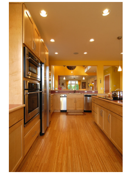
Plenty of floor space to maneuver

No raised threshold, good lighting, and wide doorways