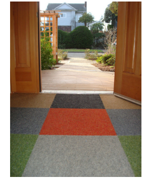
Wide doorways, step free, landing on the same level as the floor inside the home

We help policy makers, housing developers, housing funders, architects, human service providers, members of the disability community, and the general public recognize, own, and promote good design for all. We illustrate options, offer resources, and empower people.